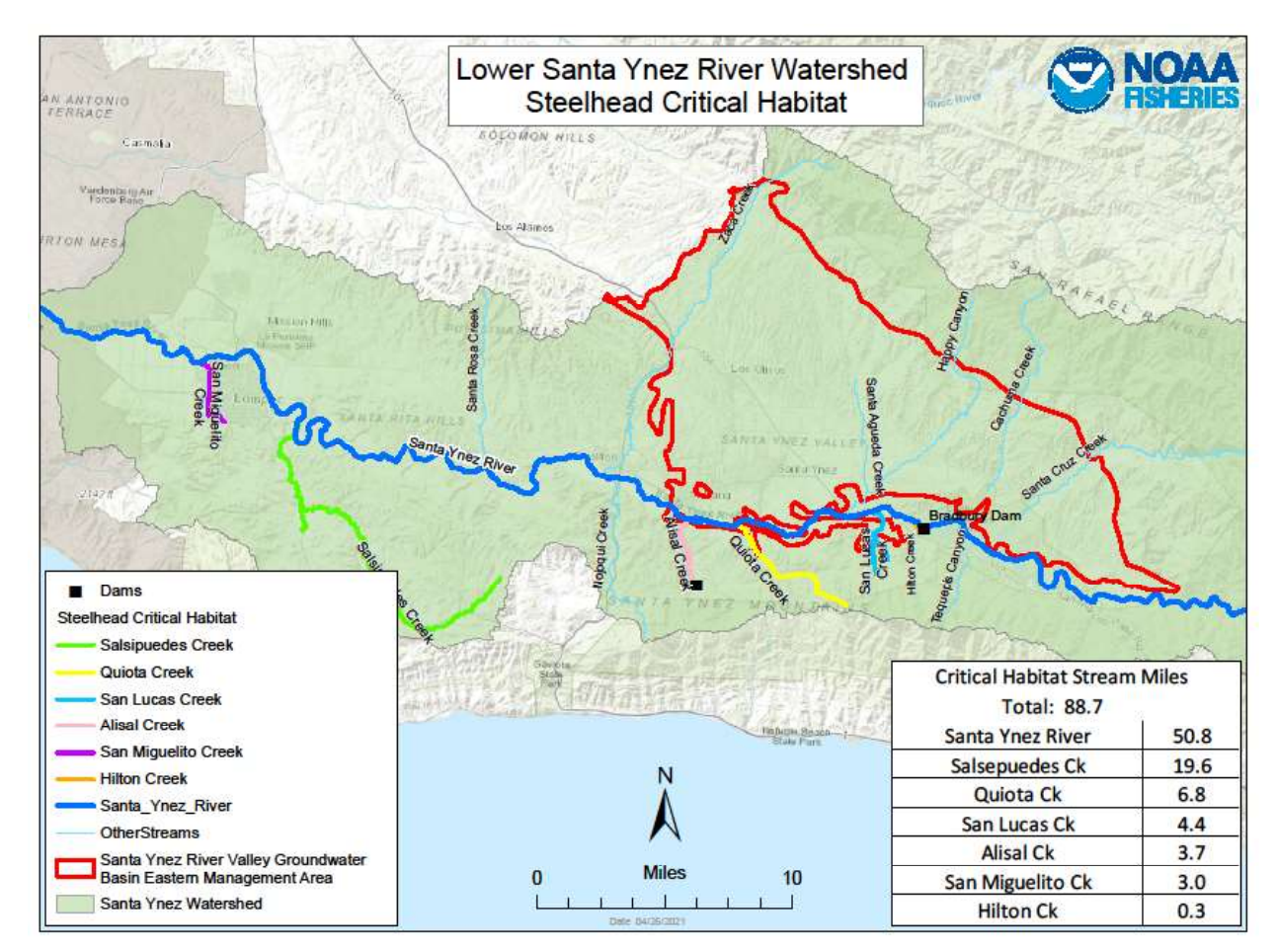
Figure 1. Lower Santa Ynez River Steelhead Critical Habitat Map. Source: 70 FR 52488). Final Rule: Endangered and Threatened Species; Designation of Critical Habitat for Seven Evolutionarily Significant Units/Distinct Population Segments of Pacific Salmon and Steelhead in California.